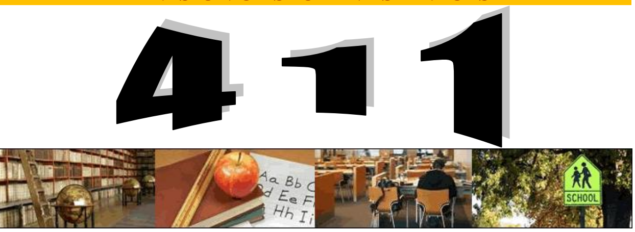
Weekly Information Bulletin "Connects Students to What is Happening On Campus" June 14, 2010 to June 18, 2010