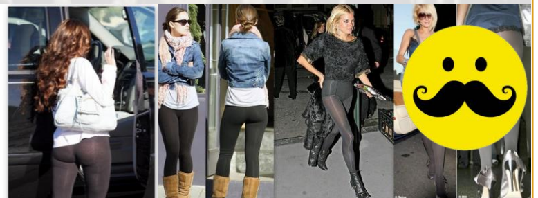
see through. | We don't want to see your lady parts | unless your in Ballet, tights should not be pants | Seriously? NO!