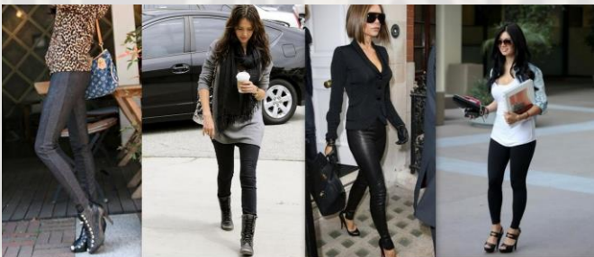
thick fabric side detailing | Shirt is covering all parts that should be covered | leather is chic | not see-through