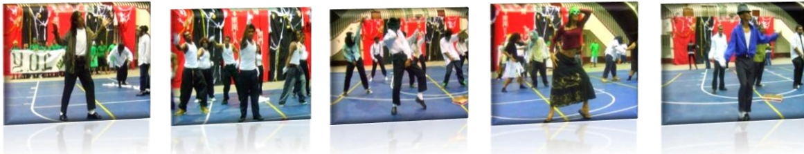
MTV Showdown photos: Courtesy of Jim Kneubuhl

SGA donating school supplies & textbooks purchased as a result from their Dollar drive, Book Drive, ASCC matching fund and MTV fundraising to students directly affected by the earthquake/tsunami, plus Back sacks, pens, & key chains donated by Blue Sky.