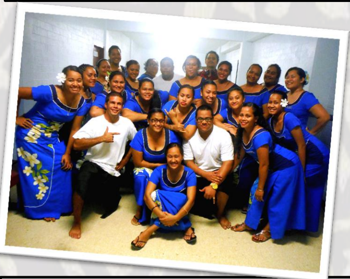
The Business Ambassadors of ASCC (BAOA) celebrate a successful performance before their parents and family at Parent's Night, presented by the Business Department.