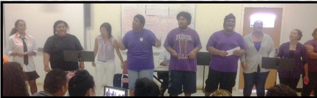
(Left) ASCC Glee Club during their Halloween Jam Session (10/31/13)

Teachers: Remember to have your students complete student evaluation forms – NO EXCEPTIONS – assign one student to return the forms to the Academic Affairs Office.