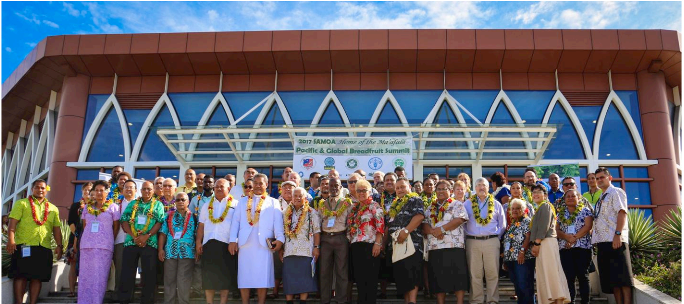
The ASCC-ACNR Director, Horticulturalist, and Agriculture Extension Manager attended the 2017 Samoa “Home of the Ma’afala” Pacific & Global Breadfruit Summit, October 10-12, 2017.

The ASCC-ACNR team conducted two presentations: