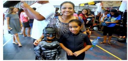
ASCC 2017 Student Government Association (SGA) Halloween Carnival

Twenty-six ASCC HOSA students were inducted in the State HOSA which includes the Secondary schools. The AHEC Coordinator is currently the advisor for the HOSA students.