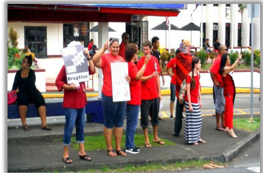
ASCC Red Wave: Supporting a Drug Free Community

Institutional Priority 4: Community Outreach, Extension, and Research