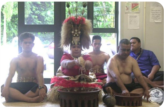
Students Association for Faasamoa (SAFF)