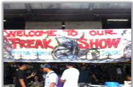
ASCC: SGA Halloween Carnival