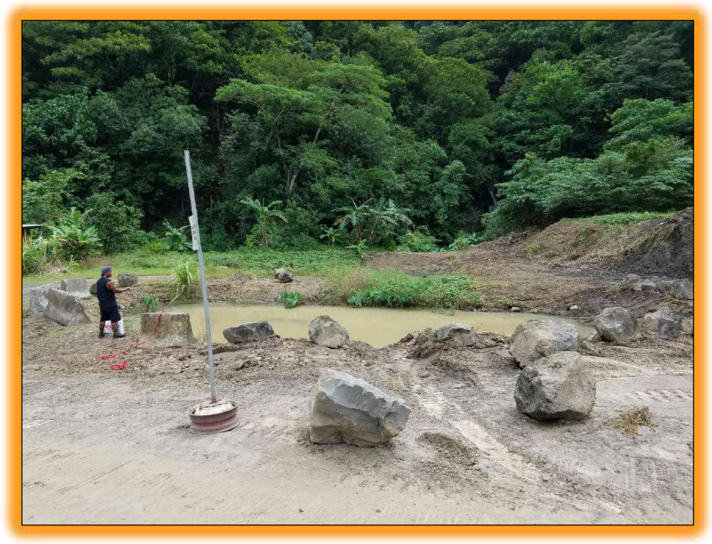
Niela Leifi of ASCC-ACNR assessing a potential mosquito breeding habitat at Fagaalu quarry. Fortunately, no disease-carrying mosquitoes were found at the site.

ACNR Assists CRAG and Fagaalu Village With Mosquito Assessment: ACNR Entomology staff visited Fagaalu village at the request of the Fagaalu mayor and the Coral Reef Advisory Group to help address concerns about possible mosquito breeding in some ponds in the village. The ponds were constructed near the quarry in the village to capture runoff and reduce flow of harmful sediments into the stream and out onto the reef. Fortunately it was found that the ponds were not producing mosquitoes known to carry human diseases in American Samoa. ACNR emphasizes that the mosquitoes that carry diseases in American Samoa breed in water-holding containers such as drums, buckets, used tires, etc. It's important for all of us to do our part to prevent dengue by getting rid of these kinds of items around our homes, schools and workplaces.