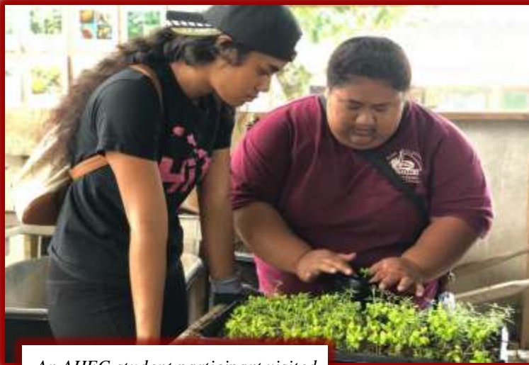
An AHEC student participant visited the ASCC-ACNR greenhouse and learned how to transplant seedlings.

The AHEC summer program offered students the opportunity to explore health care careers available on island. Students were exposed to inter-professional settings, where they learned clinical and administrative skills, and had the opportunity to shadow health professionals. In the classroom, the students engaged in interactive discussions and presentations centering on leadership and personal growth. The students were also immersed in several activities that included life-saving skills such as swimming, self-defense, and CPR.