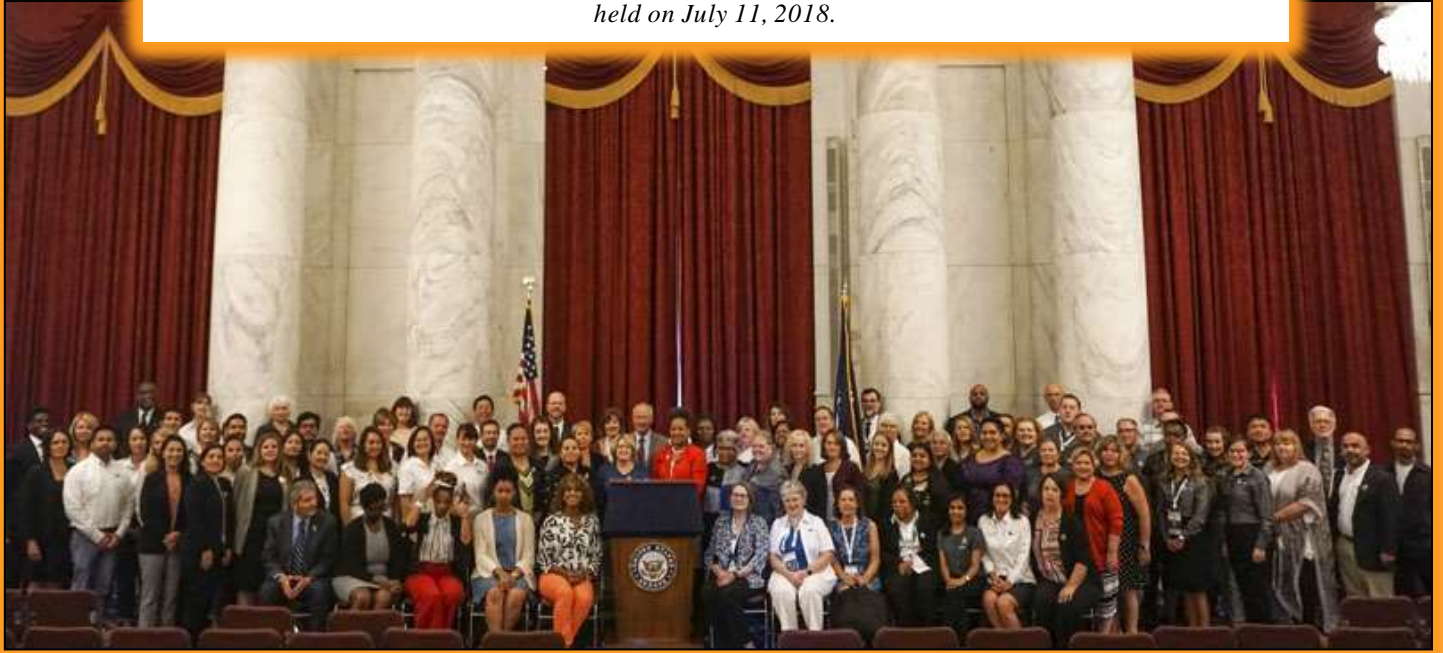
AHEC coordinators and partners getting ready to charge the Hill during the 2018 NAO Conference held on July 11, 2018.

AHEC Summer Health Academy visit ACNR: Students participating in the American Samoa Area Health Education Center (AHEC) 2018 Summer Health Academy visited ACNR to gain experience and explore health professions. A total of 24 students and two interns were given a tour of ACNR's facilities to see the contributions to the enhancement of human health by ACNR. The group participated in hands-on activities at the Fruits for Life Greenhouse and was shown some of the social media educational materials that have been created by ACNR.