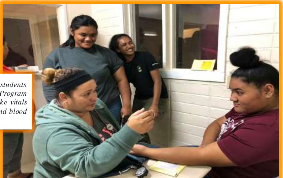
Pictured here are AHEC students with ASCC-Nursing Program students learning how to take vitals by measuring pulse rates and blood pressure.