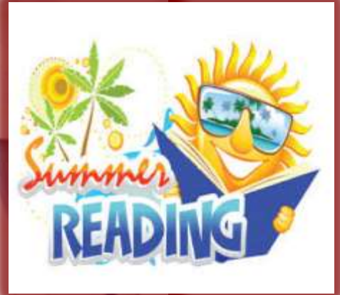
Reading Program Opening Ceremony: There were about 120 students and 15 volunteers.

The purpose of the program was to kindle and nurture a love for reading in children ages five to 12 years old, and to help mitigate the loss of reading skills that commonly occurs over the summer break. Classes were taught for three hours every Tuesday and Thursday for a six-week period throughout the summer break.