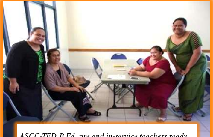
ASCC-TED B.Ed. pre and in-service teachers ready to take the lead in the Summer Reading Program.