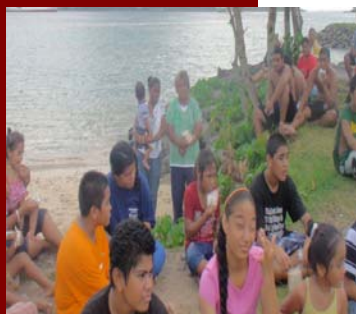
Children participating in the “Disability Track & Field” in Utulei.

It was early and it was rainy, windy, with low tide but it did not stop the families, friends and individuals with developmental disabilities (DD) in participating in the event by the American Samoa Track & Field committee which was led by Ms.