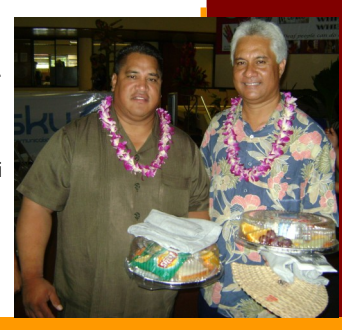
Representatives Satele and Sanitoa during the Deaf Awareness Opening in May 2010

local and federal policies that affect or change the benefits of individuals and children with DD. Fa'afetai ma fa'amalo le lagolago!