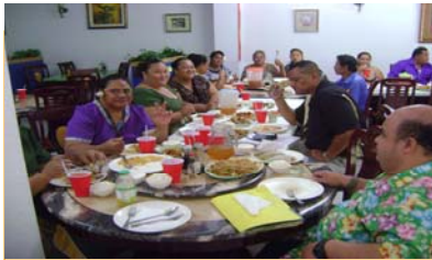
Members of the disability community during the

The University Center for Excellence on Developmental Disabilities (UCEDD) is approaching the ending of their 5 year funding cycle and data is needed from the disability community, parents, family members and agencies. A meeting was held on October 20, 2011 with approximately 25 family members, consumers, and some agencies on completing a survey. Having more individuals with disabilities, parents, and family members was a plus considering they are