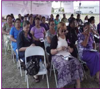
During the opening ceremony in Tafuna

October is designated as Domestic Violence (DV) Awareness month since the U.S. Congress passed the legislation in 1989. American Samoa joined in the fight to stop domestic violence and observed the month of October for DV as Honorable Governor Togiola Tulafono signed